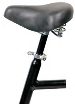
Illustration 3: Adjustable seat.