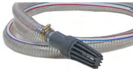
Illustration 2: Intake hose. Submerge the intake hose head into water source.