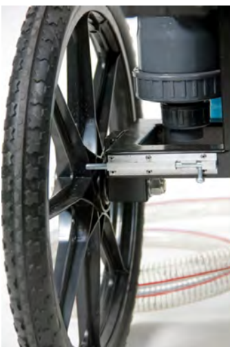
Illustration1: Brakes to prevent the wheels from rolling