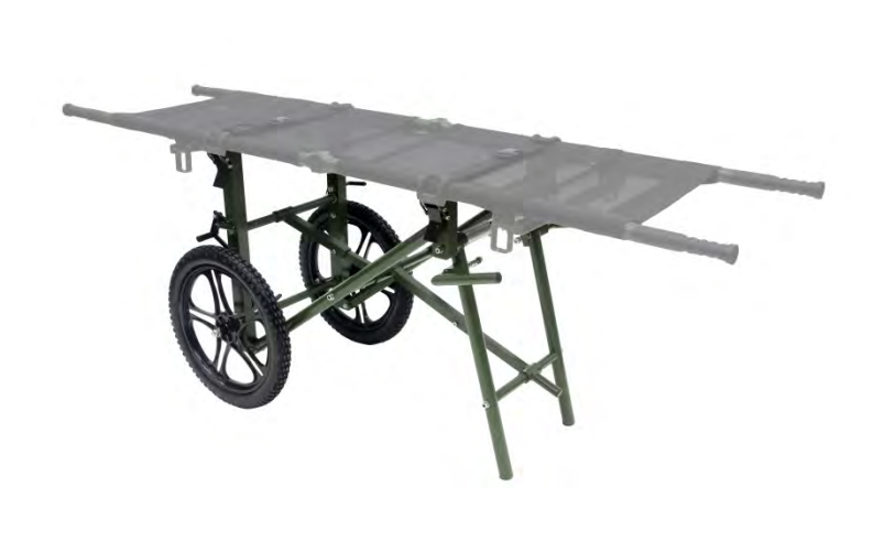
Stretcher Wheel Cart