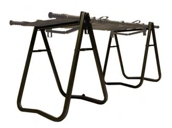
MedEvac4 Tactical Litter Stand