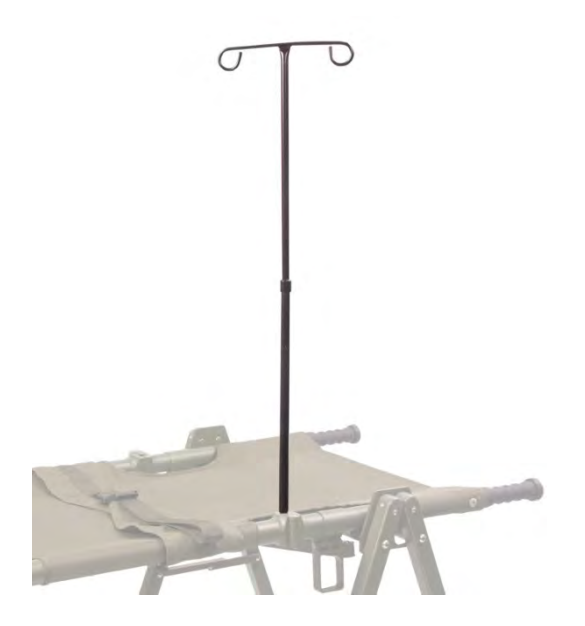
MedEvac4 IV Pole