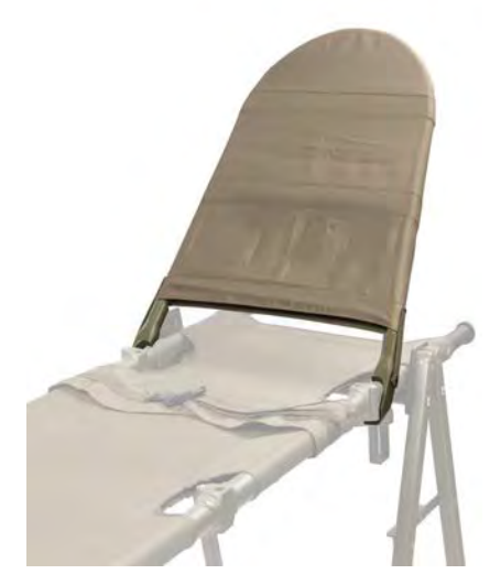
MedEvac4 Stretcher Backrest

The MedEvac2 Tactical Stretcher can be used with the following compatible products to enhance field capabilities and scope of use: