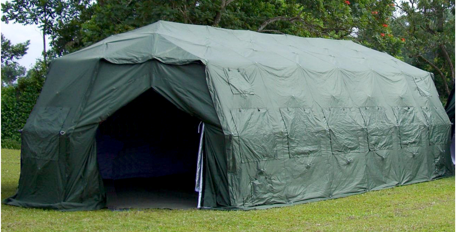
6A model, A series