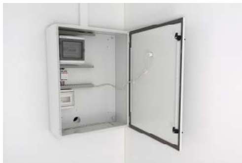
Interior view of shelter enclosure.